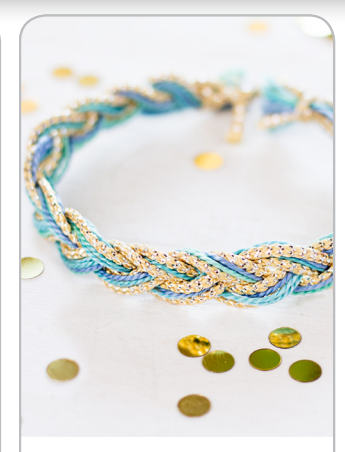
Elena's Bracelet Create a braided bracelet with a pop of gold just like Elena's!